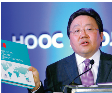
His Excellency Mr Elbegdorj Tsakhia , President of Mongolia, referring to the IMD World Competitiveness Report on Mongolia during the annual Mongolia Economic Forum

Workshops: Competitiveness workshops can be organized in your country either to complement a special report or independent of a report. The program, which is typically one or two days long, is customized based on your expectations, interests and objectives.